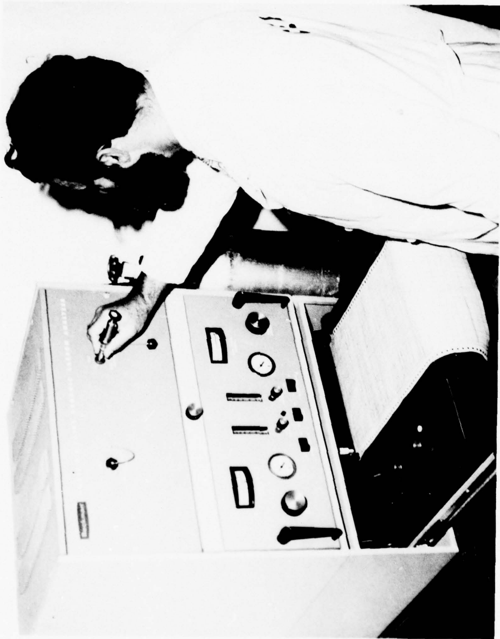
Figure 1. Total Organic Carbon Analyzer.