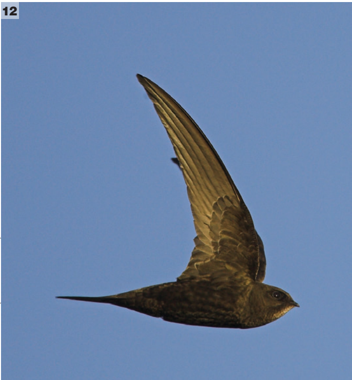
12 Adult Common Swift (Oegstgeest, The Netherlands, 18 May 2009). This individual is an easy identification – small headed, slim winged and slim bodied, especially behind the wing. The throat patch is also small and discrete, not large and diffuse. The underparts are plain and show little scaling. A bird looking like this and seen this well should present no identification problems at all.