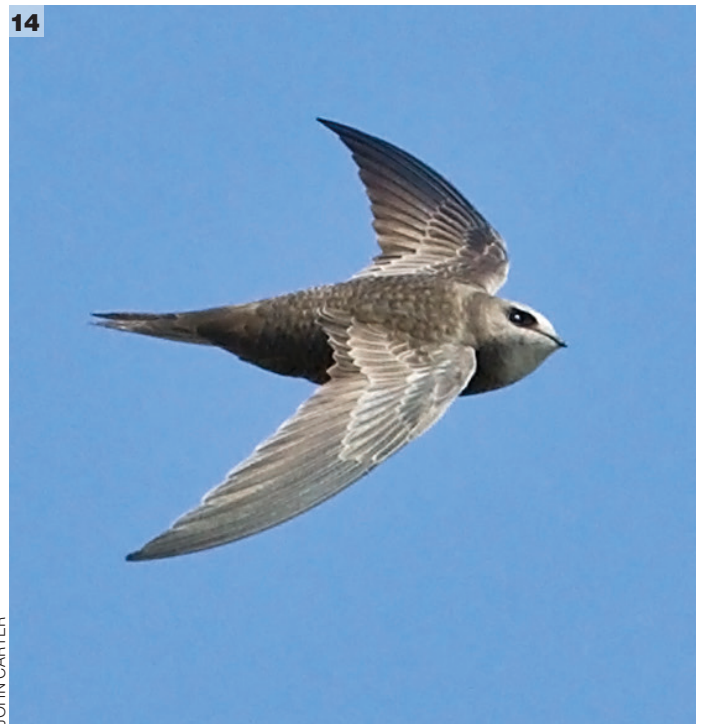
14 Pallid Swift (Kessingland, Suffolk, 2 April 2010). This single image gives conflicting impressions. The camera has captured a broad-bodied look, an extensive and diffuse white throat and a contrasting dark mantle but the rest of the bird looks a dark ashy grey, the wing-tip looks quite pointed and the tail rather slim. It is always necessary to consider the whole range of structural and plumage characters from prolonged field views. In this case the grey hues are a photographic artefact, while the true structural characters are not shown to best effect.