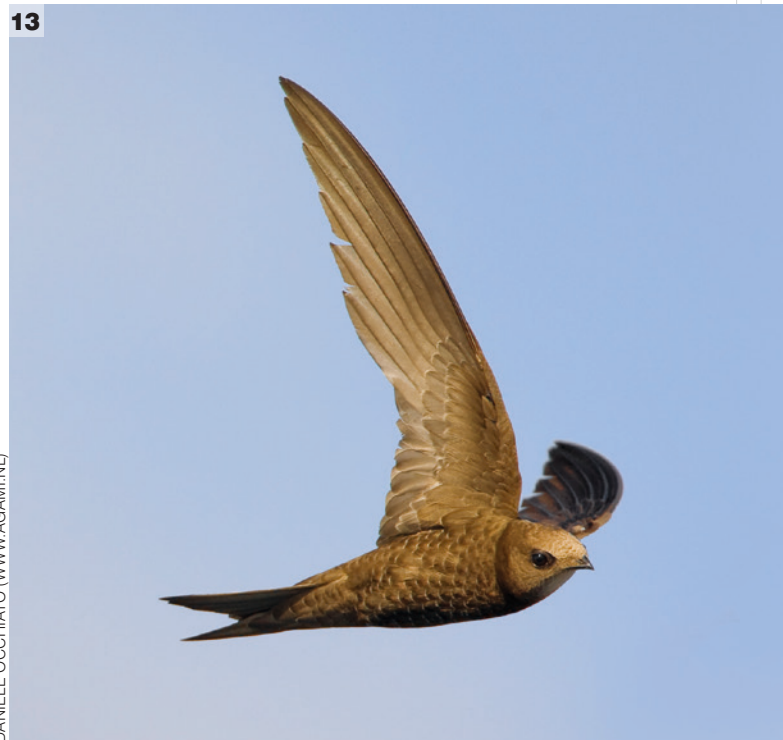
13 Pallid Swift (Amato, Italy, 21 August 2008). The plumage hues are shown perfectly, the outer wing, rear body and tail fork structure are shown beautifully and it has lovely underpart scaling and a large and diffuse throat patch. There is also a good suggestion of the species' broad-headed appearance, though this is best appreciated when head on.